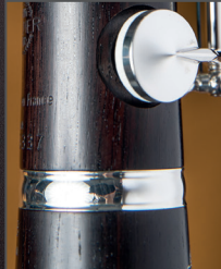
New ring design

The original laser engraving on the bottom body of the instrument is inspired by the values of generosity, listening and transmission of the musical practice.