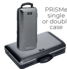
PRiMe single or double case