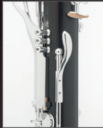
Adjustable thumb rest