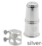
silver-plated ligature and cap

Echo is a universal mouthpiece suitable for all clarinetists and the first Henri SELMER Paris clarinet mouthpiece to be entirely manufactured on a digitally controlled machine, giving it an unprecedented production stability.