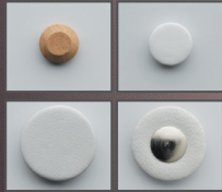
Efficient sealing: leather pads fitted with resonators for the low notes (except Eb), Gore-Tex pads on the upper join and cork pads for the 12 th key