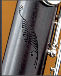
The feather, a symbol of lightness and creative freedom