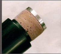
Upper joint fitted together with the crimped metal lower joint