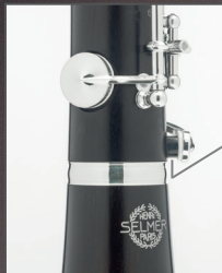
Correction tone hole for low E on the lower joint!