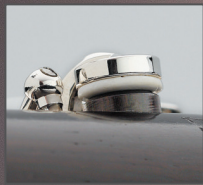
G#/C# precision optimized by a raised tone hole