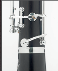
Correction system for low F and E notes with adjusting screw